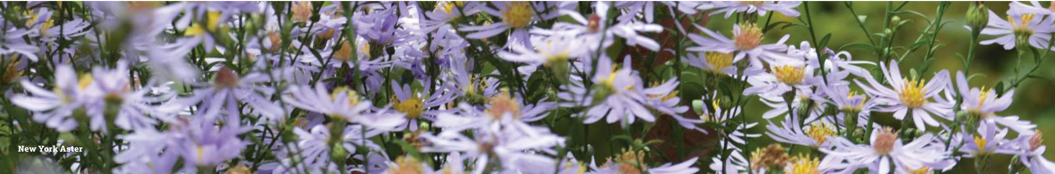
New York Aster